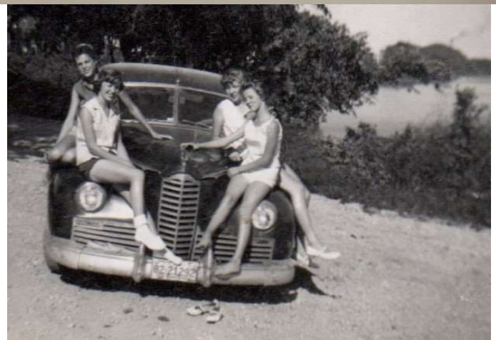
Recognize these beauties on the Buffalo levy?