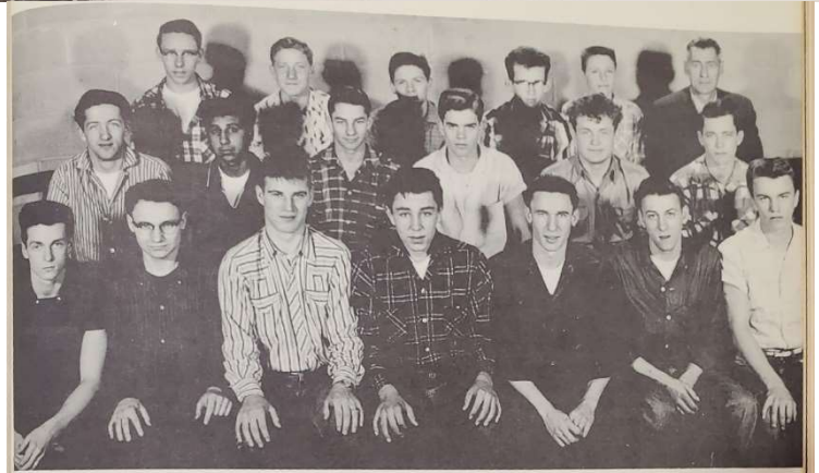
HIGH SCHOOL FOOTBALL TEAM