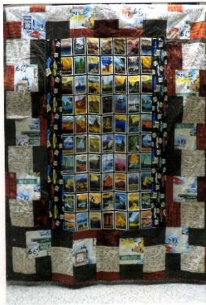
(52" X 62")