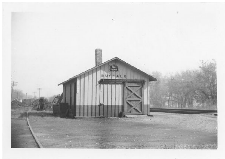
University of Iowa | digital.lib.uiowa.edu/railroadiana