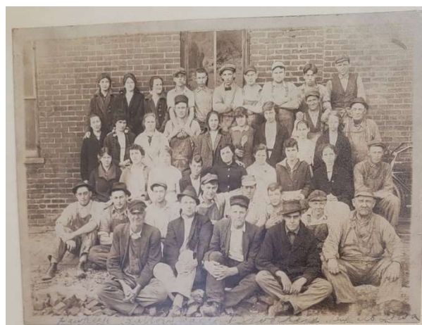
HAWKEYE BUTTON FACTORY Buffalo, Iowa