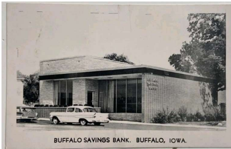
BUFFALO SAVINGS BANK. BUFFALO, IOWA.